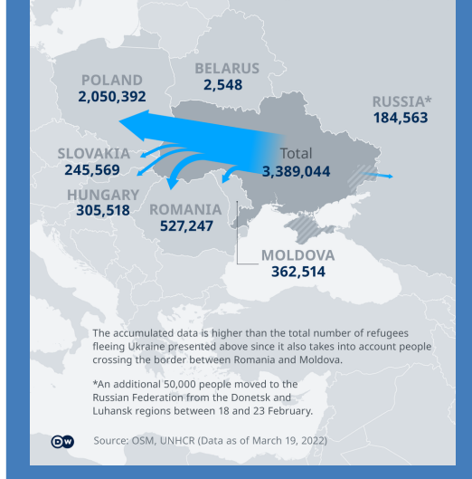
Map showing where refugees are going (Data as of 3/19)